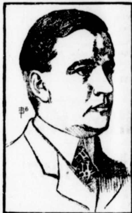
J. C. W. BECKHAM.

Frankfort, Ky., Jan. 31.—The predicted and expected deadlock in the race for United States senator is now a certainty, and it may continue till the end of the legislative session. Since the balloting began on Jan. 14 all the Republican members of the legislature have steadily voted for their nominee, former Governor W. O. Bradley, while six Democrats have declined to vote for their nominee, former